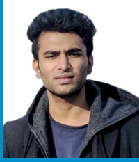
Ashish Mishra Uttar Pradesh